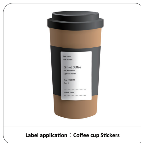
Label application : Coffee cup Stickers